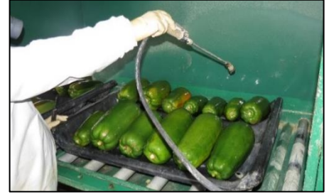
Antimicrobial use is still required in spray systems so that a hostile environment on equipment is maintained that limits cross contamination, biofilm formation, and the establishment of environmental pathogens.