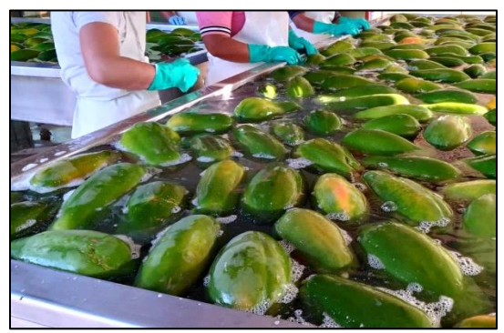
To reduce risk of infiltration, papaya must not be submerged in wash water for more than 2 minutes.

2. Papaya should not be immersed in wash tanks for more than 2 minutes or submerged more than 30 cm to minimize potential for infiltration. These recommendations assume that the antimicrobial levels in the water are being maintained and monitored.