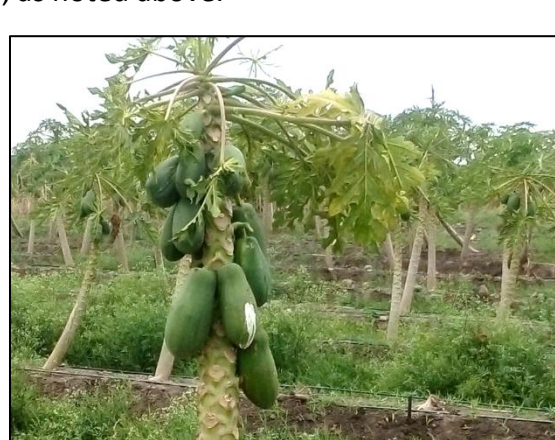
Do not harvest fruit if it is visibly contaminated with animal excreta