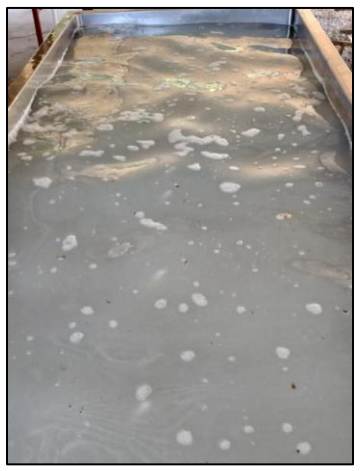
Water should be changed when there is visible buildup of dirt and organic material and/or when consistent antimicrobial levels can no longer be maintained.