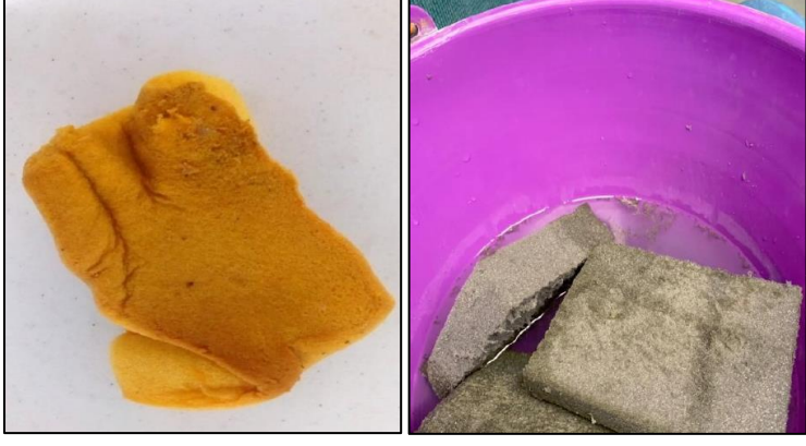
Sponges should be discarded and replaced if they are visibly dirty or are reasonably likely to lead to cross-contamination of papayas.