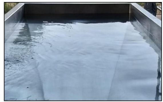
Antimicrobial levels are most effectively maintained in clean wash water.