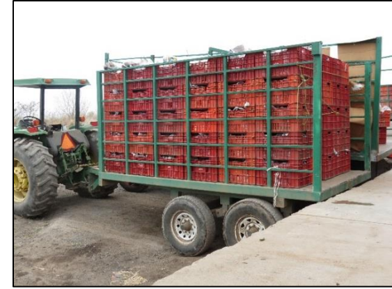
Consider using inexpensive, single-use slip-sheets under the harvest totes to minimize the transfer of soil contamination from the bottoms of crates to papayas when stacked for transport

2. Any material (e.g. paper) used for lining of crates/wheelbarrows, or used to protect fruit or during transportation to the packinghouse, must be single-use only.