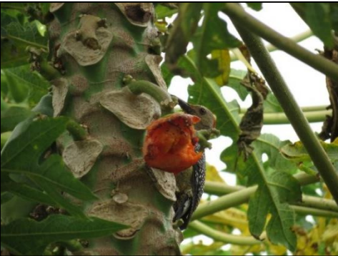
Birds can be vectors for pathogens such as Salmonella. Take measures to limit their presence in papaya groves.